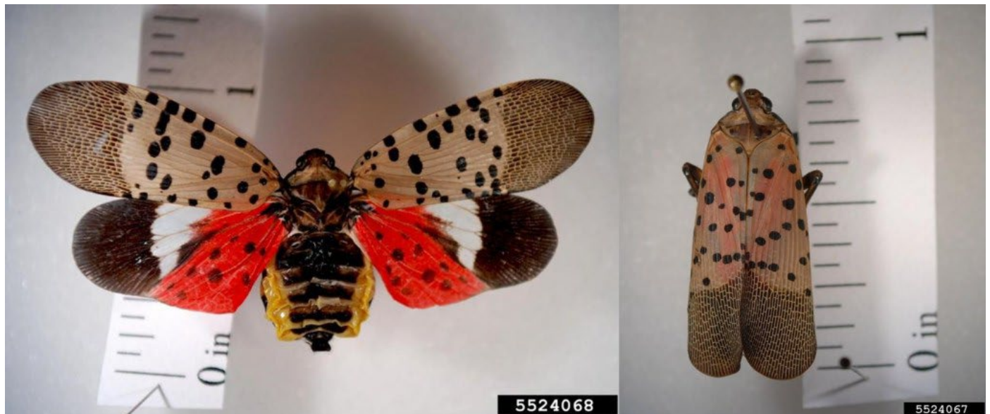
Figure 1: Adult spotted lanternflies are distinct looking insects; their fore wings are half spotted and half reticulated, while the back wings are a mixture of black, white, and red. On the left, the wings are open and showing all of the color; on the right is how the insect is most likely to be encountered– with the wings closed over its back.

SLF is very distinctive in appearance.; the adult is about an inch long, with strikingly patterned forewings that mixes spots with stripes. The back wings are contrasting red, black, and white. The immature stages are black with white spots and develop red patches as they age. They are a type of planthopper; they are capable of jumping and can be quite fast.