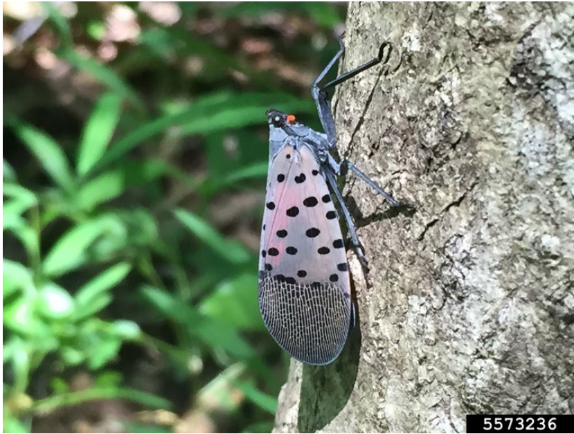
Figure 3: Spotted lanternflies feed on tender growth as nymphs before moving on to feed on the trunk and branches of trees as these bugs get larger and stronger.