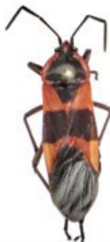
Large milkweed bug