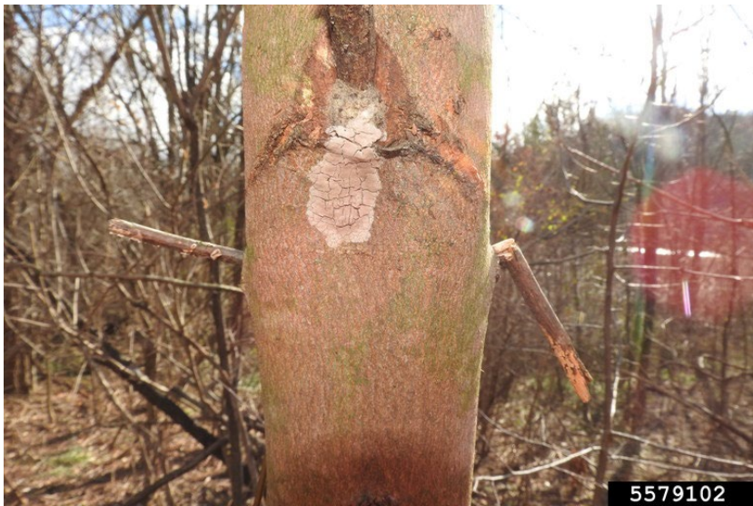
Figure 5: Be on the lookout for the weird looking adults and for the egg masses spackled onto surfaces, as seen here. Don't bring home any unwanted hitchhikers and help us by reporting odd sightings!

Kentuckians should be on the lookout for this pest. Report suspicious looking bugs and egg cases to the Office of the State Entomologist at reportapest@uky.edu . When making a report, please include an image or a sample of the suspect, otherwise it will be difficult to confirm the problem. It is also important to include geographic information. It is true that this is a difficult pest to eliminate, but with the help of citizens monitoring for populations, there is hope that their spread can be slowed to allow communities more time to prepare.